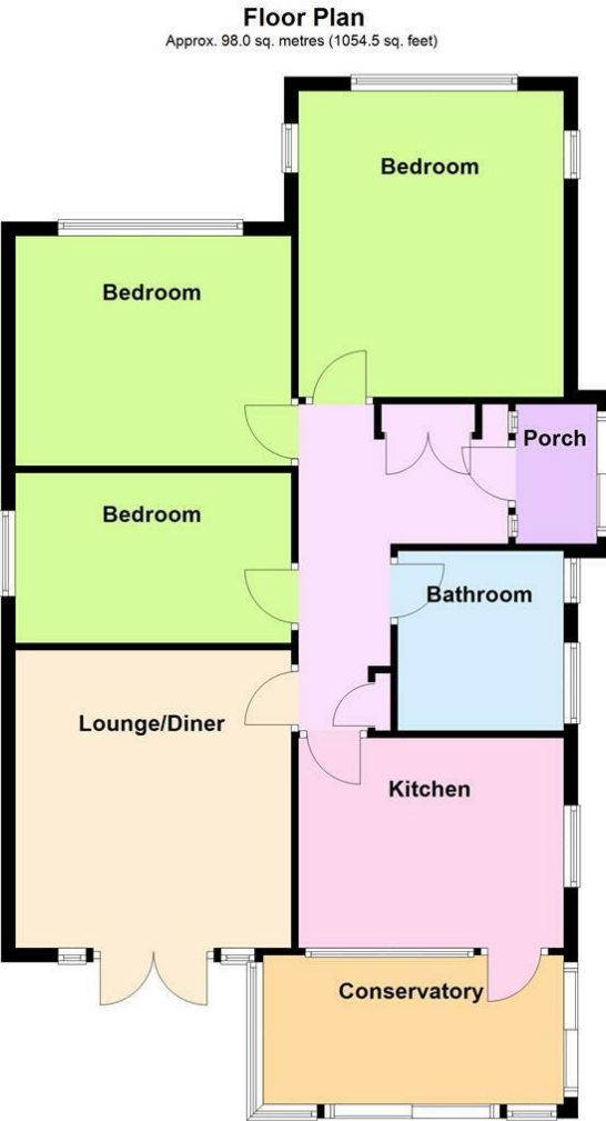
Total area: approx. 98.0 sq. metres (1054.5 sq. feet)